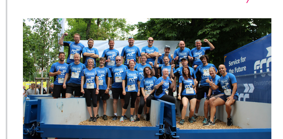
FCC Team Spirit in action, Grazathlon 2023