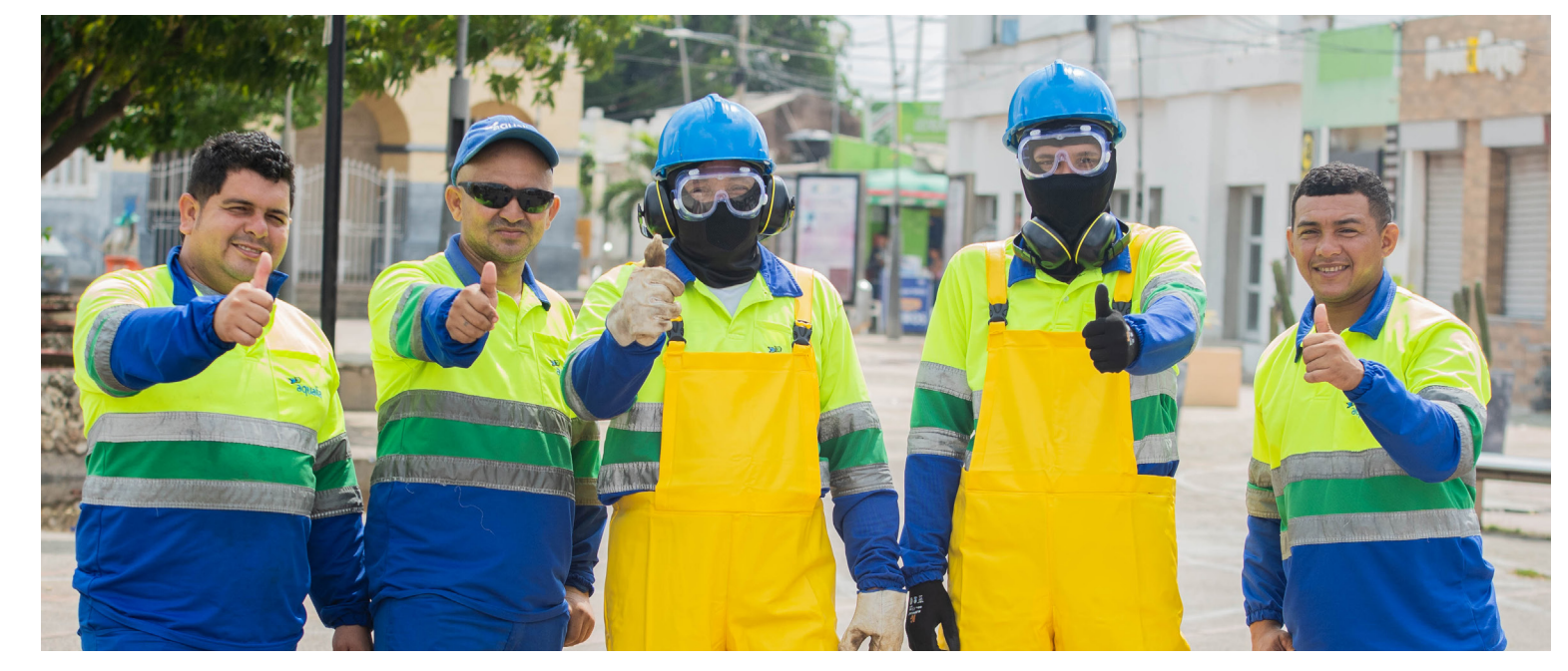
Aqualia takes over water management in Riohacha, Colombia

With the launch of operations in Riohacha, the company strengthens its presence in the country and provides service to a population of 196,000 inhabitants for a period of 30 years. This contract represents Aqualia's largest operation in Colombia.