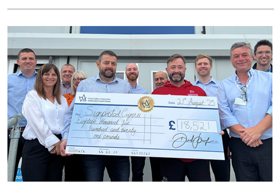
A465 Project team raises funds for a new local charity in Wales, UK